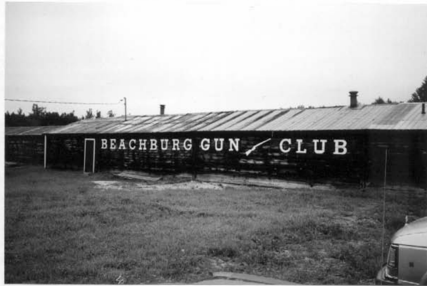
Some Pictures from the Nationals – N.Suttill .